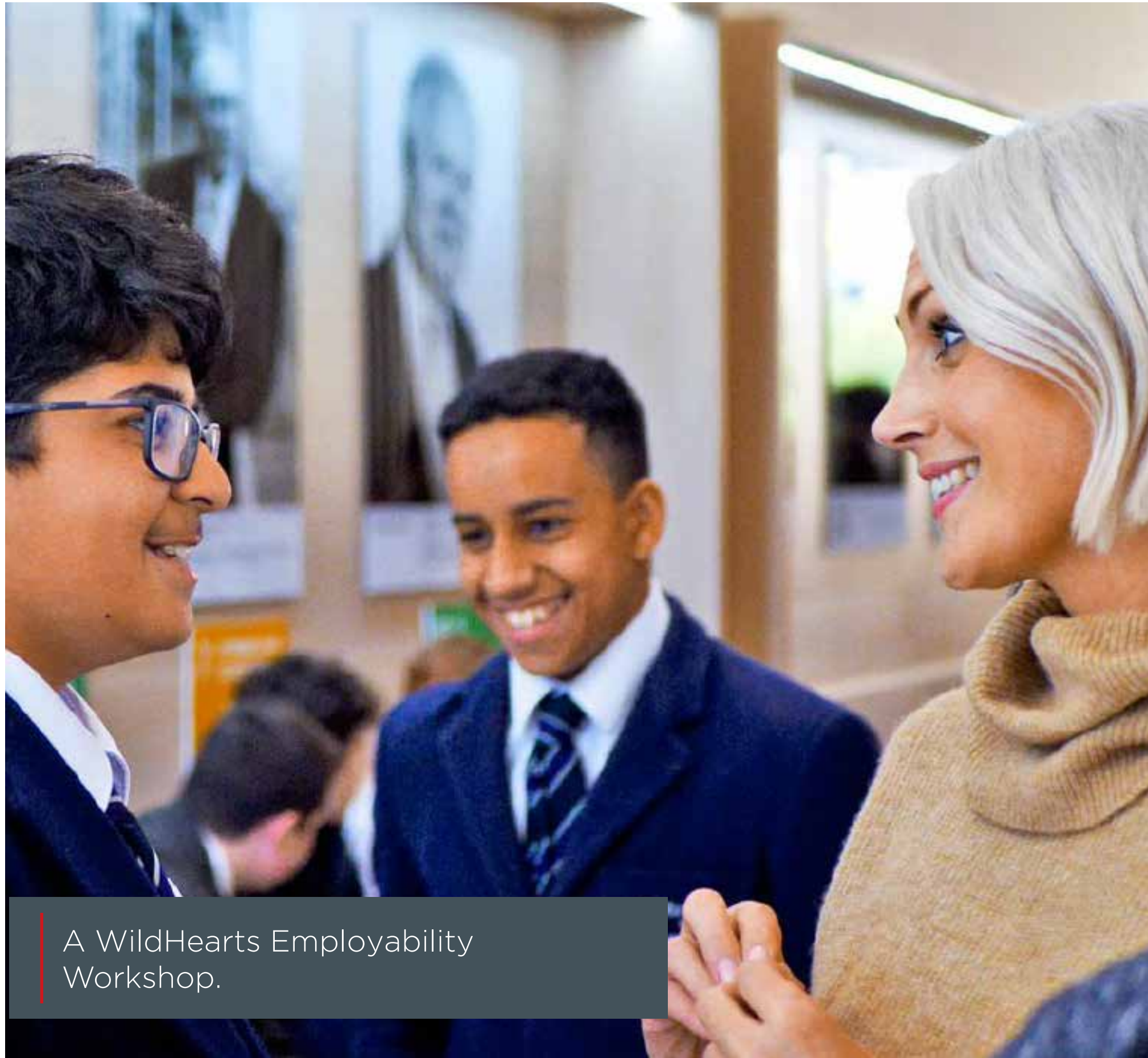
A WildHearts Employability Workshop.