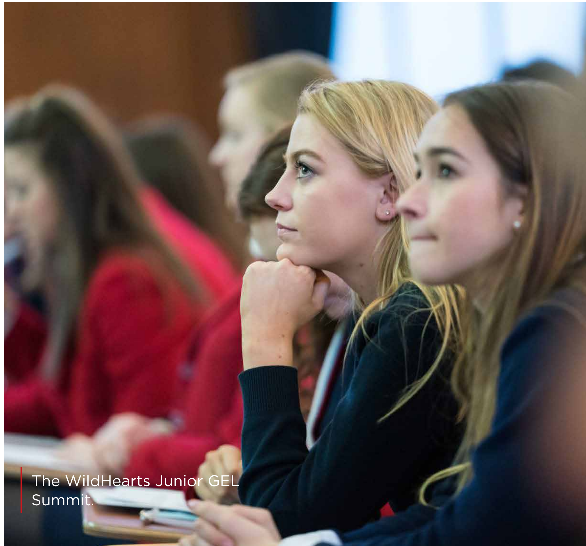
The WildHearts Junior GEL Summit.