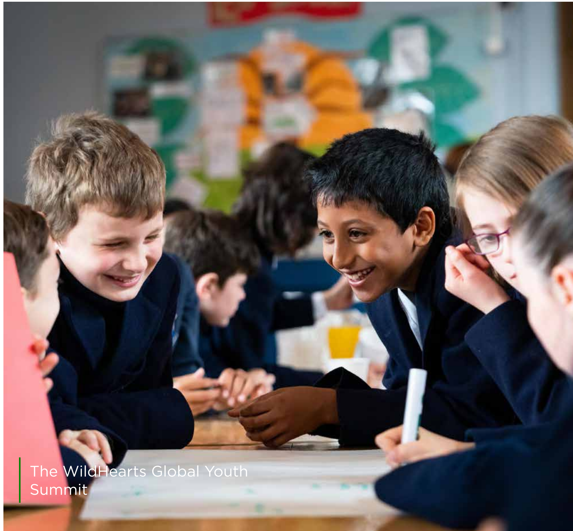
The WildHearts Global Youth Summit