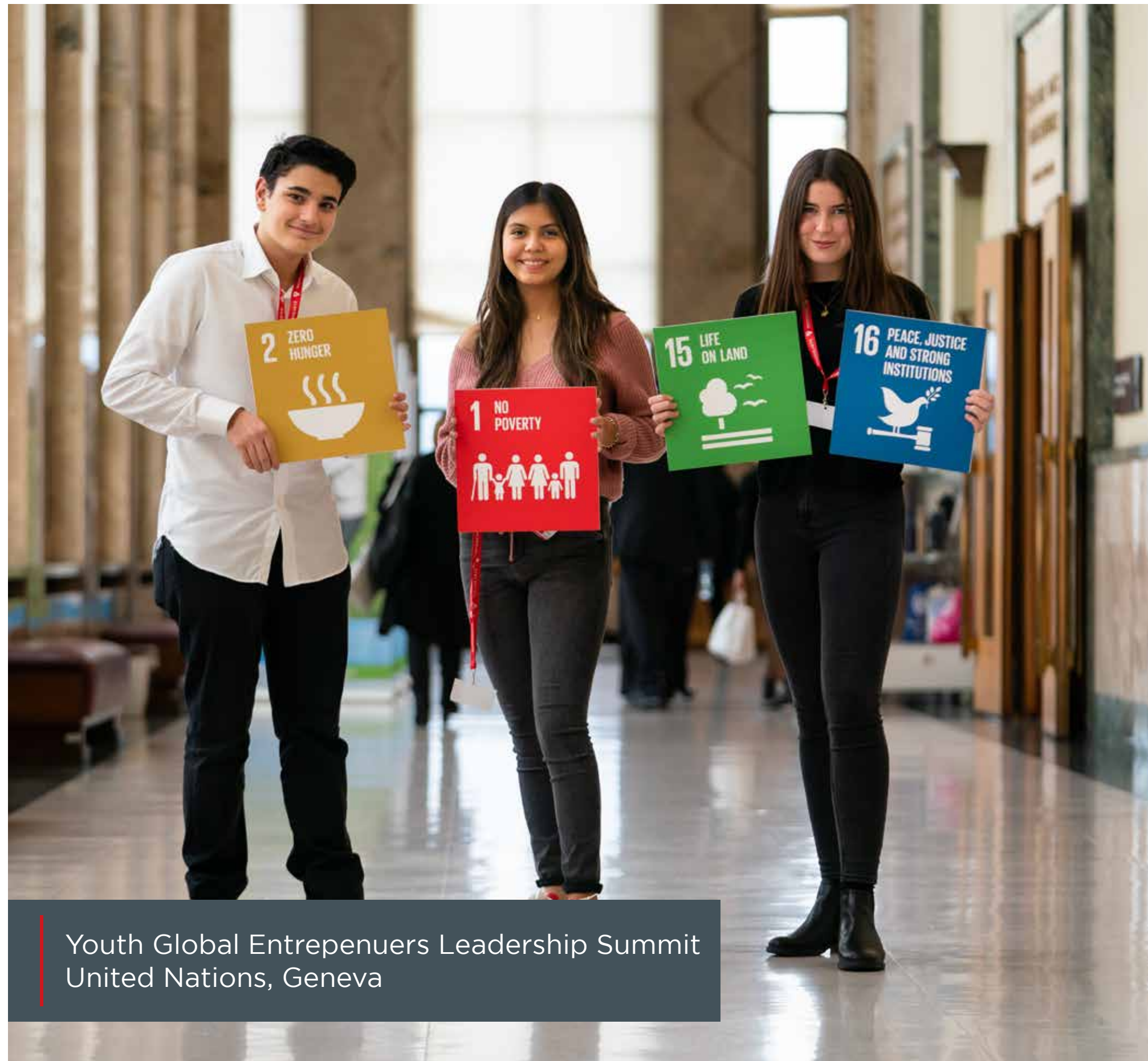
Youth Global Entrepreneurs Leadership Summit United Nations, Geneva