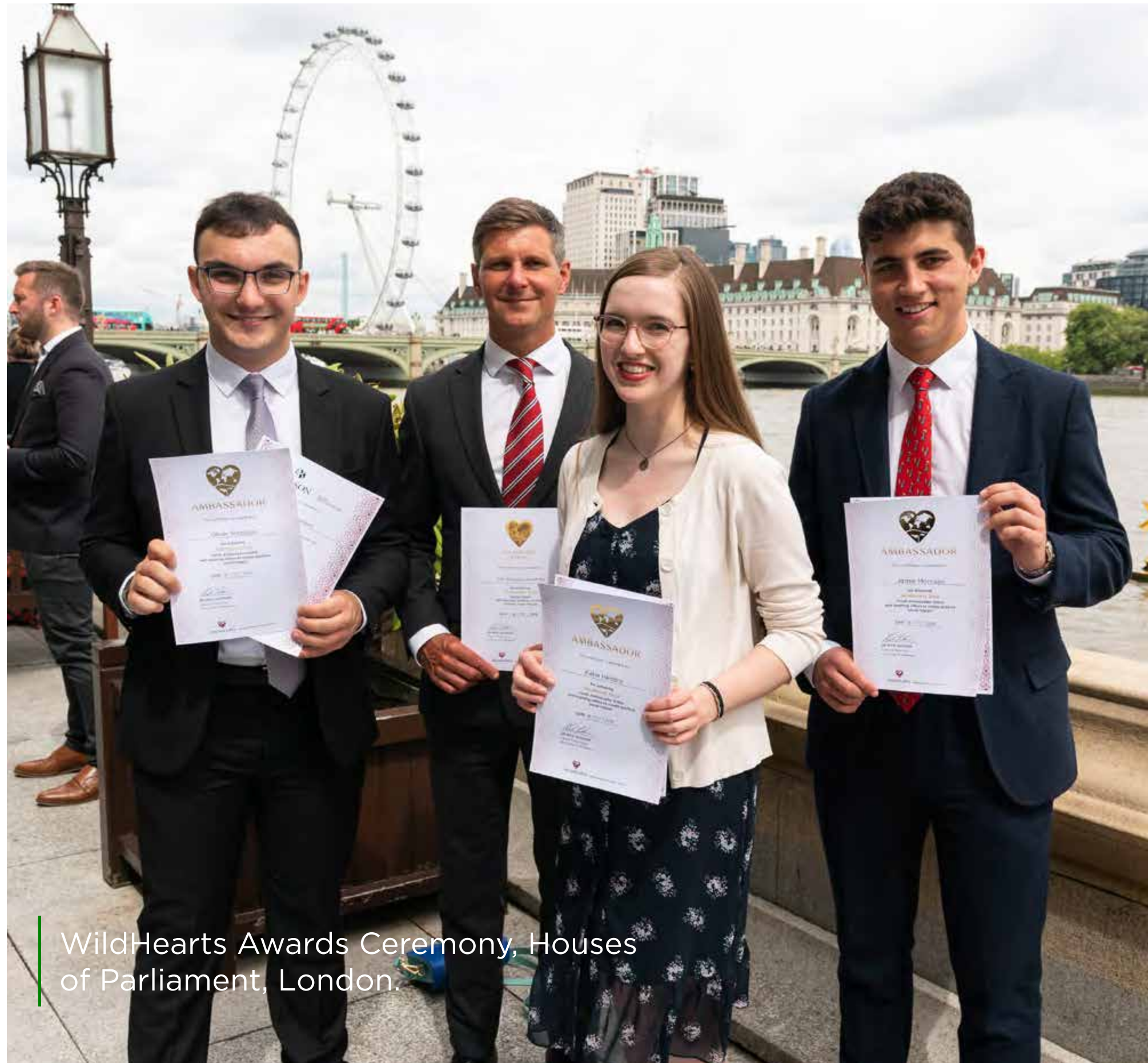
WildHearts Awards Ceremony, Houses of Parliament, London.