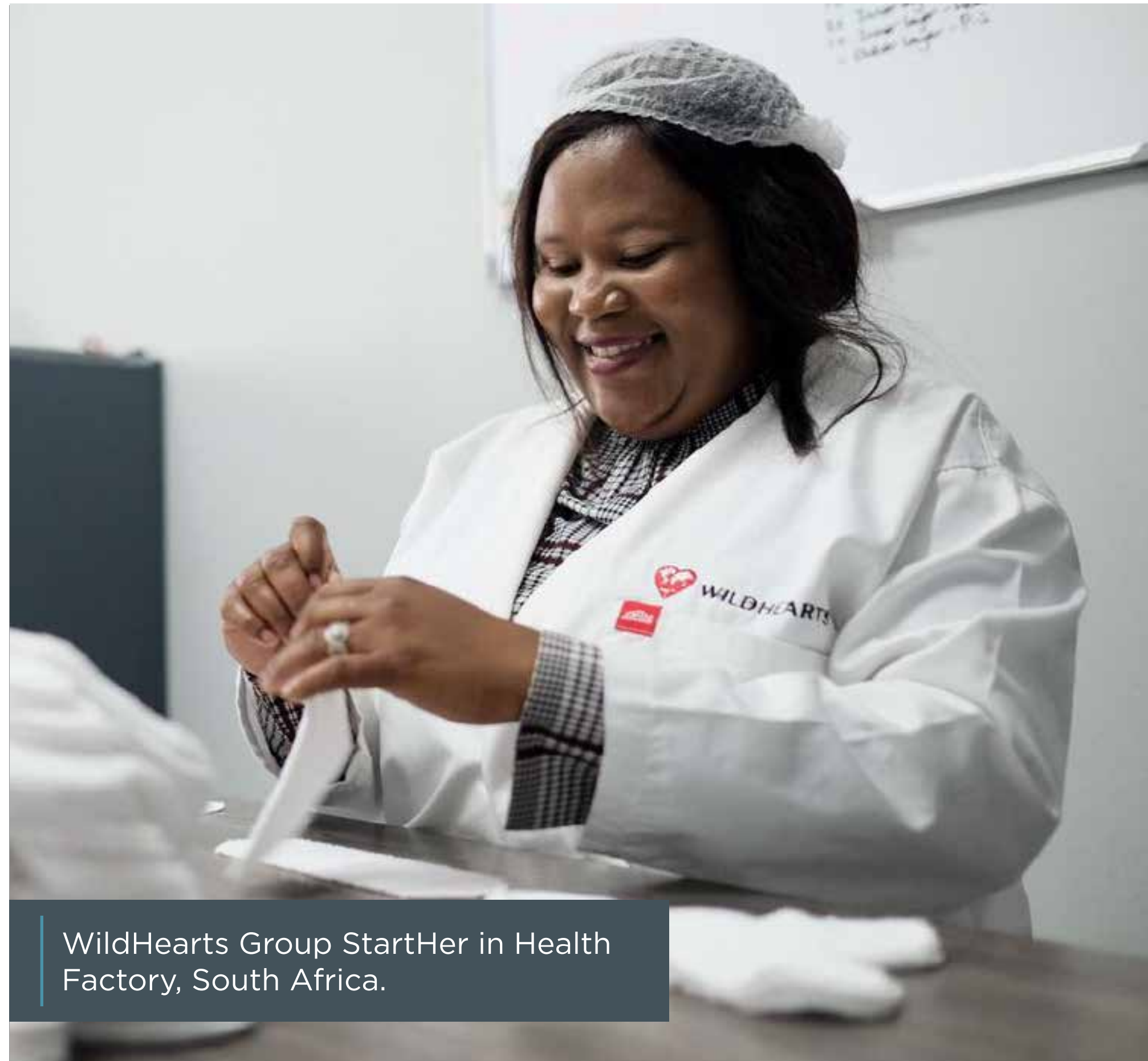
WildHearts Group StartHer in Health Factory, South Africa.